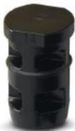
Filler plugs, length: 20 mm, diameter: 13 mm, color: black

Please be informed that the data shown in this PDF Document is generated from our Online Catalog. Please find the complete data in the user's documentation. Our General Terms of Use for Downloads are valid ( http://phoenixcontact.com/download )