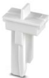
Switching lock, length: 15.65 mm, width: 8.3 mm, height: 26.5 mm, color: white

Please be informed that the data shown in this PDF Document is generated from our Online Catalog. Please find the complete data in the user's documentation. Our General Terms of Use for Downloads are valid ( http://phoenixcontact.com/download )