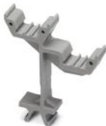
Double marker carrier, snaps onto the spring-cage terminal blocks ST 2.5..., labeled with ZB 5 or ZBF 5

Please be informed that the data shown in this PDF Document is generated from our Online Catalog. Please find the complete data in the user's documentation. Our General Terms of Use for Downloads are valid ( http://phoenixcontact.com/download )