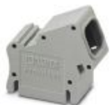
Cable housing, width: 15.6 mm, number of positions: 3, color: gray