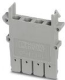
Connector housing, length: 31.6 mm, width: 5.2 mm, height: 31.7 mm, number of positions: 4, color: gray

Please be informed that the data shown in this PDF Document is generated from our Online Catalog. Please find the complete data in the user's documentation. Our General Terms of Use for Downloads are valid ( http://phoenixcontact.com/download )