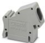
Cable housing, width: 10.4 mm, number of positions: 2, color: gray