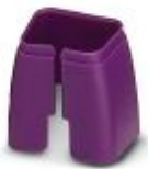
Color marking for patch cable, purple

Color-coding - FL PATCH CCODE VT - 2891990