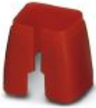
Color marking for patch cable, red

Color-coding - FL PATCH CCODE RD - 2891893