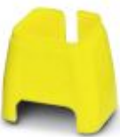
Color marking for patch cable, yellow

Color-coding - FL PATCH CCODE YE - 2891592