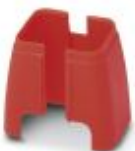
Security element for FL patch cable

Port Guard Security Element - FL PATCH SAFE CLIP - 2891246