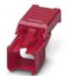
Lockable security element

Port Guard Security Element - FL PATCH GUARD - 2891424