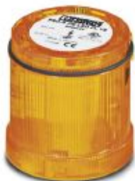
LED flashing beacon element, 24 V DC, double flash, yellow

Please be informed that the data shown in this PDF Document is generated from our Online Catalog. Please find the complete data in the user's documentation. Our General Terms of Use for Downloads are valid ( http://phoenixcontact.com/download )