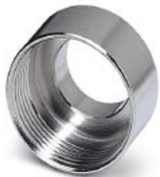
Extension adapter, material: Brass, nickel-plated, connecting thread: Pg21, color: silver

Please be informed that the data shown in this PDF Document is generated from our Online Catalog. Please find the complete data in the user's documentation. Our General Terms of Use for Downloads are valid ( http://phoenixcontact.com/download )