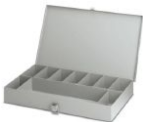
Assortment box, metal, no components mounted

Please be informed that the data shown in this PDF Document is generated from our Online Catalog. Please find the complete data in the user's documentation. Our General Terms of Use for Downloads are valid ( http://phoenixcontact.com/download )