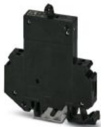
Thermomagnetic circuit breaker, 1-pos., normal blow, 1 N/O contact, with universal foot for mounting on NS 32 or NS 35

Please be informed that the data shown in this PDF Document is generated from our Online Catalog. Please find the complete data in the user's documentation. Our General Terms of Use for Downloads are valid ( http://phoenixcontact.com/download )