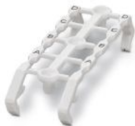
Marker for terminal blocks, white, labeled, mounting type: snapped, for terminal block width: 4 mm, lettering field size: 2,4x 9,2 mm

Please be informed that the data shown in this PDF Document is generated from our Online Catalog. Please find the complete data in the user's documentation. Our General Terms of Use for Downloads are valid ( http://phoenixcontact.com/download )