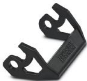
Replacement plastic single locking latch, for HC-EVO-D15.....BK housing

Please be informed that the data shown in this PDF Document is generated from our Online Catalog. Please find the complete data in the user's documentation. Our General Terms of Use for Downloads are valid ( http://phoenixcontact.com/download )