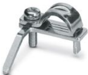
Shield connection clamp for PCB terminal blocks up to 1.5 mm 2

Please be informed that the data shown in this PDF Document is generated from our Online Catalog. Please find the complete data in the user's documentation. Our General Terms of Use for Downloads are valid ( http://phoenixcontact.com/download )