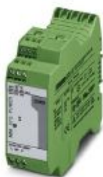
Primary-switched MINI POWER supply for DIN rail mounting, input: 1-phase, output: 24 V DC/1.5 A

Please be informed that the data shown in this PDF Document is generated from our Online Catalog. Please find the complete data in the user's documentation. Our General Terms of Use for Downloads are valid ( http://phoenixcontact.com/download )