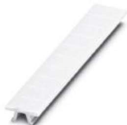
Zack marker strip, 10-section, vertically labeled with the consecutive numbers: 301 ... 310, white, width: 6 mm

Please be informed that the data shown in this PDF Document is generated from our Online Catalog. Please find the complete data in the user's documentation. Our General Terms of Use for Downloads are valid ( http://phoenixcontact.com/download )