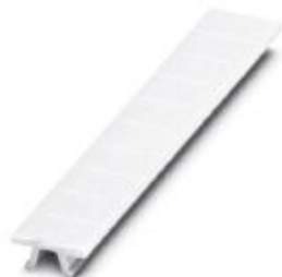
Zack marker strip, 10-section, vertically labeled with the consecutive numbers: 281 ... 290, white, width: 6 mm

Please be informed that the data shown in this PDF Document is generated from our Online Catalog. Please find the complete data in the user's documentation. Our General Terms of Use for Downloads are valid ( http://phoenixcontact.com/download )