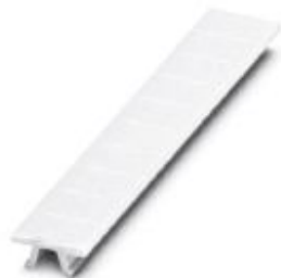
Zack marker strip, 10-section, vertically labeled with the consecutive numbers: 111 ... 120, white, width: 6 mm

Please be informed that the data shown in this PDF Document is generated from our Online Catalog. Please find the complete data in the user's documentation. Our General Terms of Use for Downloads are valid ( http://phoenixcontact.com/download )