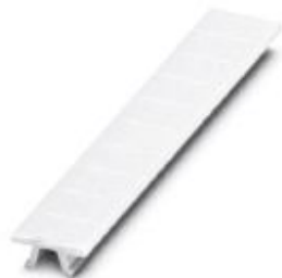
Zack marker strip, 10-section, vertically labeled with the consecutive numbers: 101 ... 110, white, width: 6 mm

Please be informed that the data shown in this PDF Document is generated from our Online Catalog. Please find the complete data in the user's documentation. Our General Terms of Use for Downloads are valid ( http://phoenixcontact.com/download )