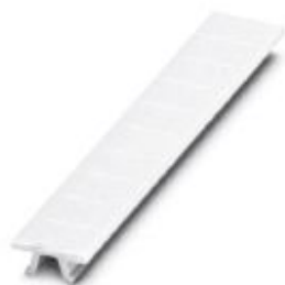
Zack marker strip, 10-section, horizontally labeled with the consecutive numbers: 71 ... 80, white, width: 6 mm

Please be informed that the data shown in this PDF Document is generated from our Online Catalog. Please find the complete data in the user's documentation. Our General Terms of Use for Downloads are valid ( http://phoenixcontact.com/download )