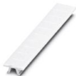
Zack marker strip, 10-section, horizontally labeled with the consecutive numbers: 141 ... 150, white, width: 6 mm

Please be informed that the data shown in this PDF Document is generated from our Online Catalog. Please find the complete data in the user's documentation. Our General Terms of Use for Downloads are valid ( http://phoenixcontact.com/download )