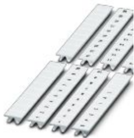
Zack marker strip, 10-section, vertically labeled with the consecutive numbers: 111 ... 120, white, width: 5 mm

Please be informed that the data shown in this PDF Document is generated from our Online Catalog. Please find the complete data in the user's documentation. Our General Terms of Use for Downloads are valid ( http://phoenixcontact.com/download )