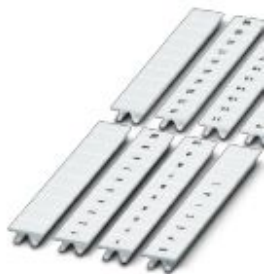
Zack marker strip, 10-section, horizontally labeled with the identical number: 20, white, width: 5 mm

Please be informed that the data shown in this PDF Document is generated from our Online Catalog. Please find the complete data in the user's documentation. Our General Terms of Use for Downloads are valid ( http://phoenixcontact.com/download )