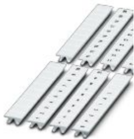
Zack marker strip, 10-section, horizontally labeled with the consecutive numbers: 441 ... 450, white, width: 5 mm

Please be informed that the data shown in this PDF Document is generated from our Online Catalog. Please find the complete data in the user's documentation. Our General Terms of Use for Downloads are valid ( http://phoenixcontact.com/download )