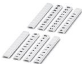
Zack marker strip flat, 10-section, horizontally labeled with the consecutive numbers: 61 ... 70, white

Please be informed that the data shown in this PDF Document is generated from our Online Catalog. Please find the complete data in the user's documentation. Our General Terms of Use for Downloads are valid ( http://phoenixcontact.com/download )