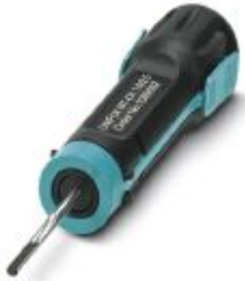
Assembly tool, for CK 1.6... crimp contacts for small conductor cross sections

Please be informed that the data shown in this PDF Document is generated from our Online Catalog. Please find the complete data in the user's documentation. Our General Terms of Use for Downloads are valid ( http://phoenixcontact.com/download )