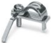
Shield connection clamp for printed circuit terminal block

Shield connection clamp - ME-SAS - 2853899