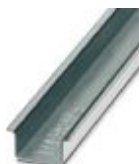
DIN rail, unperforated, Standard profile, width: 35 mm, height: 15 mm, similar to EN 60715, material: Steel, Galvanized, white passivated, length: 2000 mm, color: silver

DIN rail, unperforated - NS 35/15 WH UNPERF 2000MM - 1204135