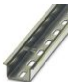
DIN rail perforated, Standard profile, width: 35 mm, height: 15 mm, similar to EN 60715, material: Steel, galvanized, passivated with a thick layer, length: 2000 mm, color: silver

DIN rail perforated - NS 35/15 PERF 2000MM - 1201730