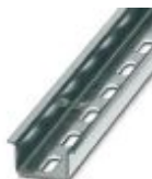
DIN rail perforated, Standard profile, width: 35 mm, height: 15 mm, similar to EN 60715, material: Steel, Galvanized, white passivated, length: 2000 mm, color: silver

DIN rail perforated - NS 35/15 WH PERF 2000MM - 0806602