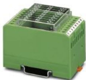
Diode module, with 8 diodes, individually wired, diode type 1N 4007

Please be informed that the data shown in this PDF Document is generated from our Online Catalog. Please find the complete data in the user's documentation. Our General Terms of Use for Downloads are valid ( http://phoenixcontact.com/download )