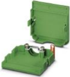
Cable housing, pitch: 3.81 mm, number of positions: 16, dimension a: 63.35 mm, color: green

Please be informed that the data shown in this PDF Document is generated from our Online Catalog. Please find the complete data in the user's documentation. Our General Terms of Use for Downloads are valid ( http://phoenixcontact.com/download )