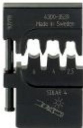
Die, for MC4 solar connectors, lateral entry, 2.5 - 6 mm 2

Please be informed that the data shown in this PDF Document is generated from our Online Catalog. Please find the complete data in the user's documentation. Our General Terms of Use for Downloads are valid ( http://phoenixcontact.com/download )