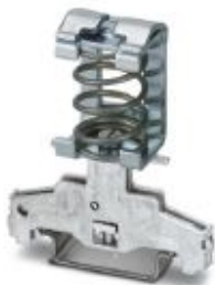
Shield connection terminal block, for applying the shield to busbars

Please be informed that the data shown in this PDF Document is generated from our Online Catalog. Please find the complete data in the user's documentation. Our General Terms of Use for Downloads are valid ( http://phoenixcontact.com/download )