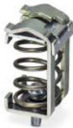
Shield connection terminal block, for applying the shield directly to the conductive mounting plates

Please be informed that the data shown in this PDF Document is generated from our Online Catalog. Please find the complete data in the user's documentation. Our General Terms of Use for Downloads are valid ( http://phoenixcontact.com/download )