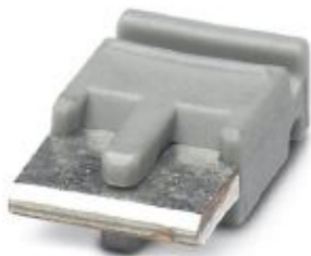
Single plug-in bridge, length: 6 mm, number of positions: 2, color: gray

Please be informed that the data shown in this PDF Document is generated from our Online Catalog. Please find the complete data in the user's documentation. Our General Terms of Use for Downloads are valid ( http://phoenixcontact.com/download )