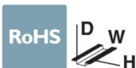
The figure shows EMG 17-REL/KSR-G 24/2E/SO38

Relay module, with soldered-in miniature switching relay, contact (AgNi): Medium to large loads, double A2 connection, 1 PDT, 230 V AC/DC input voltage