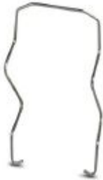
Relay retaining bracket, wire model, suitable for RIF-2 relay base

Please be informed that the data shown in this PDF Document is generated from our Online Catalog. Please find the complete data in the user's documentation. Our General Terms of Use for Downloads are valid ( http://phoenixcontact.com/download )