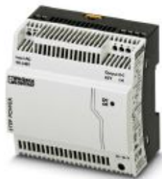
Primary-switched STEP POWER power supply for DIN rail mounting, input: 1-phase, output: 48 V DC/2 A

Please be informed that the data shown in this PDF Document is generated from our Online Catalog. Please find the complete data in the user's documentation. Our General Terms of Use for Downloads are valid ( http://phoenixcontact.com/download )