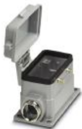
Box mounting base, for double locking latch, height 52 mm, with screw connection, 1x Pg16, with protective covers

Please be informed that the data shown in this PDF Document is generated from our Online Catalog. Please find the complete data in the user's documentation. Our General Terms of Use for Downloads are valid ( http://phoenixcontact.com/download )