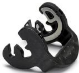
Replacement latch for HC-B10 / HC-B16/ HC-B24 housings with double locking latch (plastic design)

Please be informed that the data shown in this PDF Document is generated from our Online Catalog. Please find the complete data in the user's documentation. Our General Terms of Use for Downloads are valid ( http://phoenixcontact.com/download )