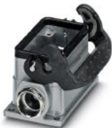
Box mounting base, with single locking latch, height 52 mm, with screw connection, 1x M20

Please be informed that the data shown in this PDF Document is generated from our Online Catalog. Please find the complete data in the user's documentation. Our General Terms of Use for Downloads are valid ( http://phoenixcontact.com/download )