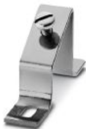
Angled brackets with M6 screw, for fixing DIN rails at an angle of 30°, height: 46 mm

Please be informed that the data shown in this PDF Document is generated from our Online Catalog. Please find the complete data in the user's documentation. Our General Terms of Use for Downloads are valid ( http://phoenixcontact.com/download )